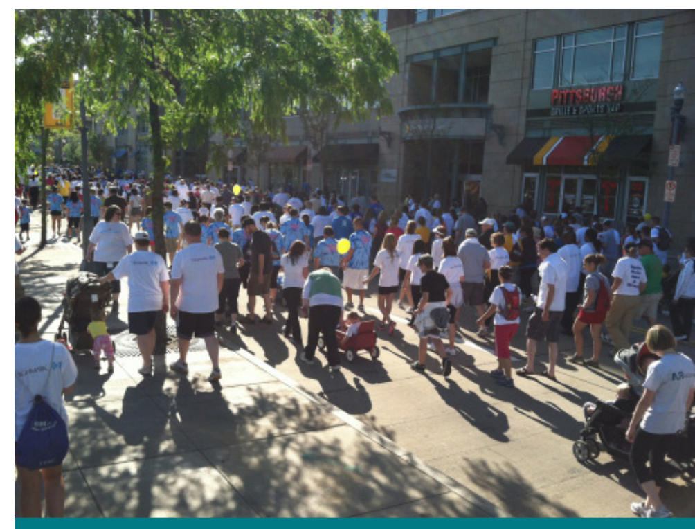
benefits local health and human service agencies in Pennsylvania

To register, visit: www.wcspittsburgh.org/highmarkwalk