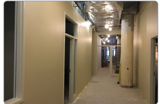
Direct Service and Administrative Offices

Up to 48 percent of domestic violence victims are unable to escape their abusers because they are concerned about what will happen to their pets. To break down this barrier, renovations include the construction of a pet area so that women are able to bring their beloved pets with them to WC&S for temporary housing, keeping families (including our furry friends!) together.